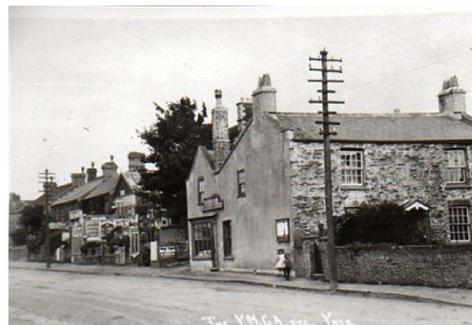
No.24 to 28 in the background 1914 (YHC)

Between the 1960s and 1980s the properties became a builder's merchant, and from 1991 Carousel Fine Art, Artist Materials, Picture Frames, Woodruff Funeral Services, Sprint Print and Yate and Sodbury Mini Skips have all occupied no.28.