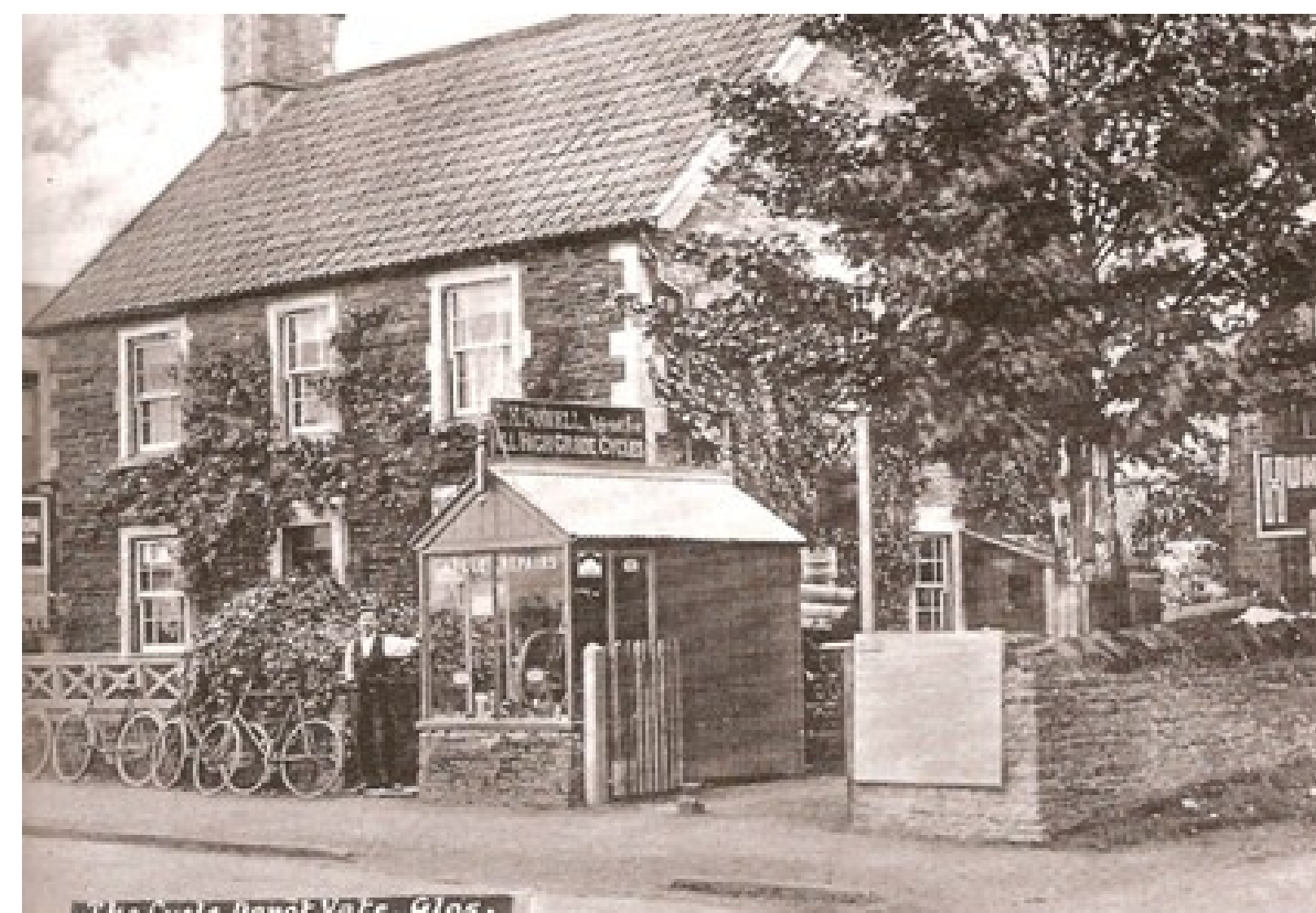
Cycle Depo 1911